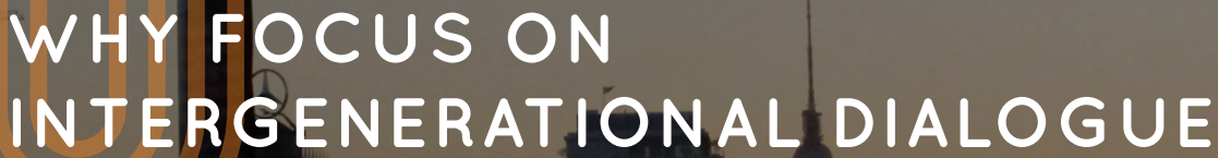
Berlin, 2021

Both older and younger adults face discrimination. For example, a UN report mentions how training and education opportunities reduce for people as they age and how young voices are rejected or disregarded when it comes to health, housing and politics.[9]